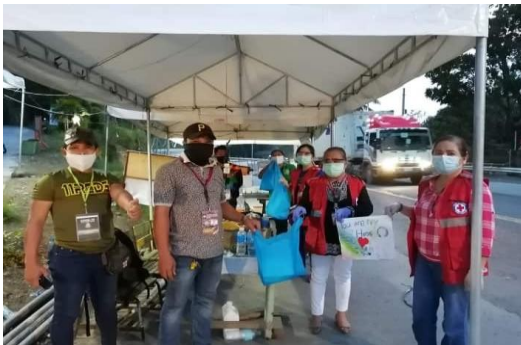
Volunteers of the House of Hope Tagum City